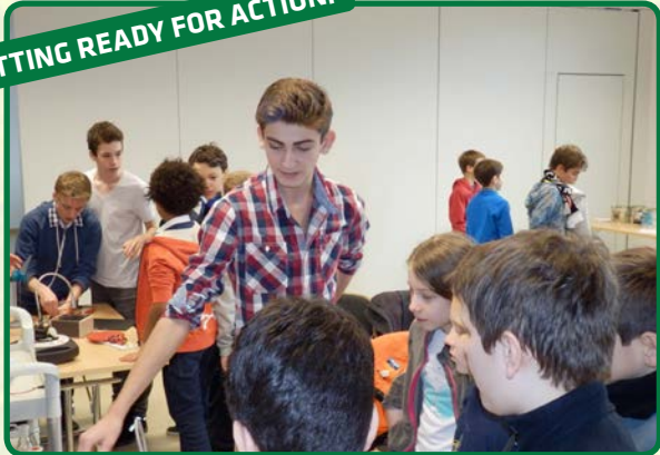
Students of the Lycée Français Victor Hugo School, Frankfurt a.M. for Going Green (2015/16)